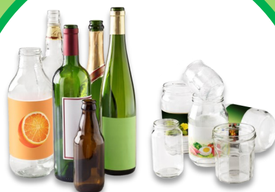
JARS, POTS, BOTTLES