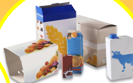
MILK CARTONS AND CARTBOARD BOXES