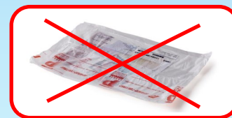
NEWSPAPER, CATALOGS, FLYERS